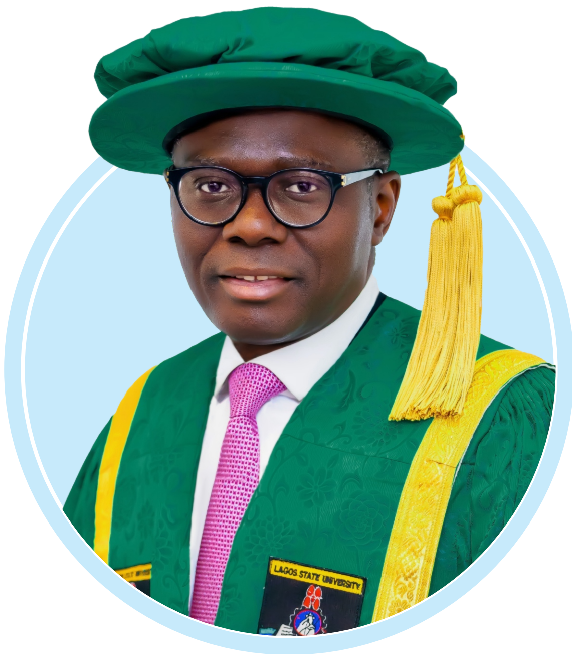
His Excellency MR. BABAJIDE OLUSOLA SANWO-OLU

Governor, Lagos State & Visitor, Lagos State University