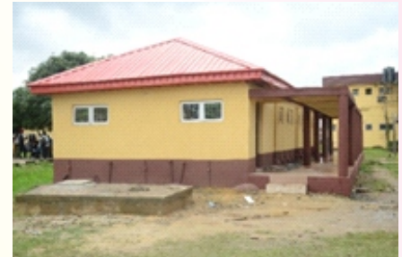
Newly built Toilet facility