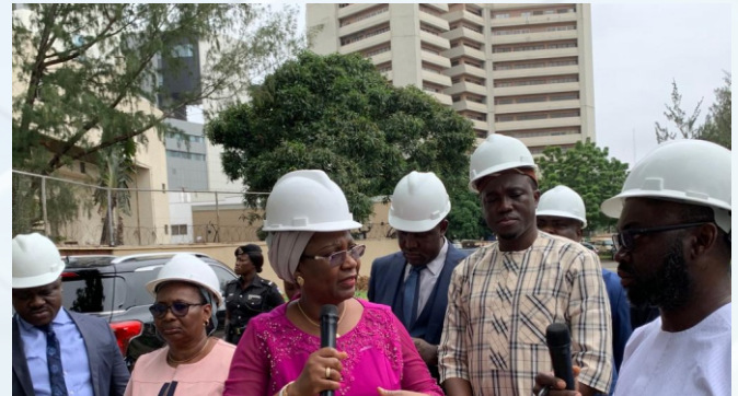
Inspection visit to the LASU Business School, Lagos Island, under construction