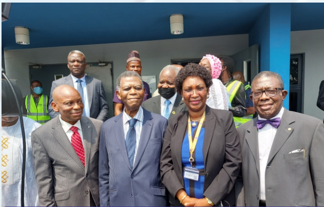
When Sir. Goodie Ibru delivered the Distinguished Personality Lecture Series of the University