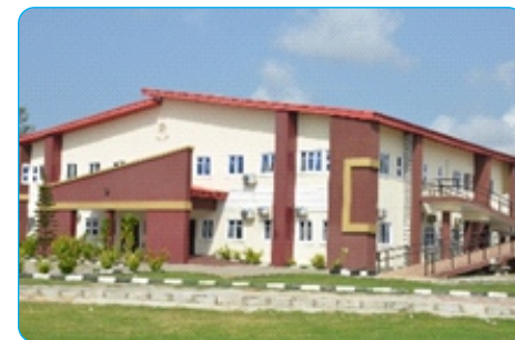
Main Library nearing competition