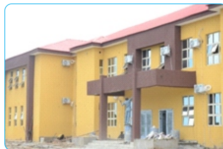
TetFund- Sponsored faculty of Arts building