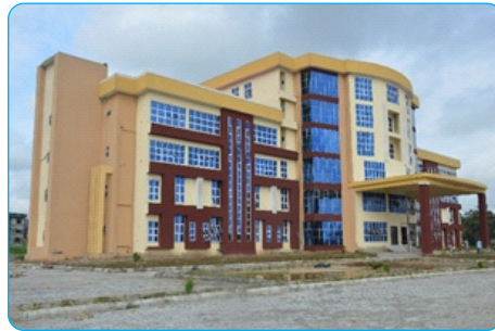
International Resource Centre, sponsored by TetFund