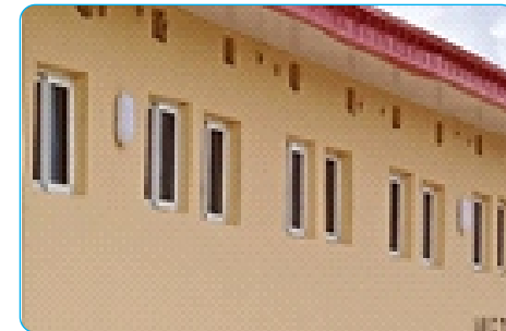
Hostel facility at Epe