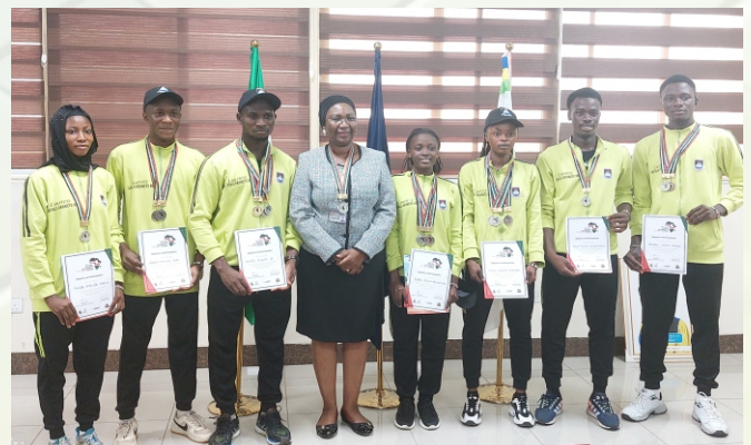
VC with the Victorious Team LASU