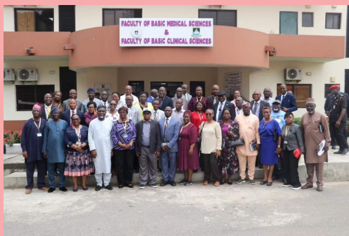
The inspection visit of the Governing Council to the College of Medicine, Ikeja