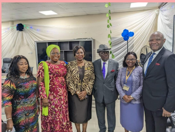
The VC and other eminent personalities in Nigeria's education sectors during the 26th Convocation of the University

The hostel was opened by the Vice Chancellor to the glory of God and use of students after documents of the Deed of Gift were signed by representatives of the LASU and LASUDEF. The hostel is dedicated to the memory of the first Military Governor of Lagos State and founding Chairman of LASUDEF, the late Brigadier General Mobolaji Johnson.