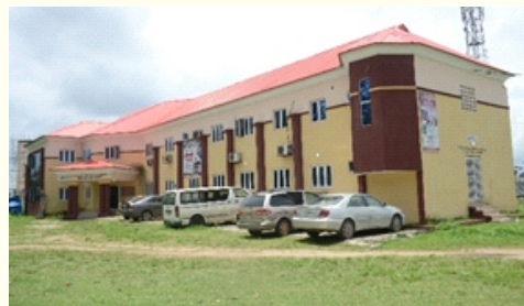
Renovated School of part-studies building