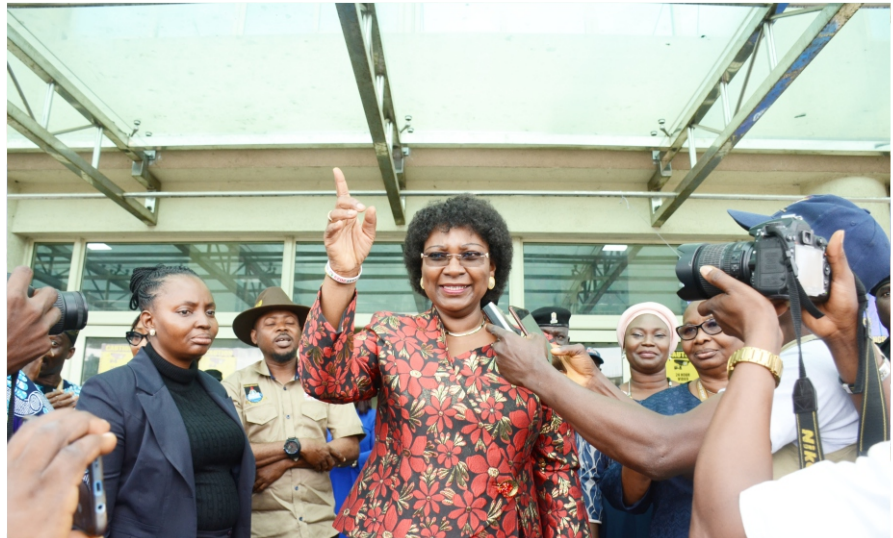
The VC on her first anniversary in office