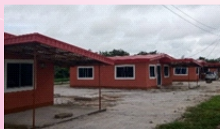
Hostel facility at Epe