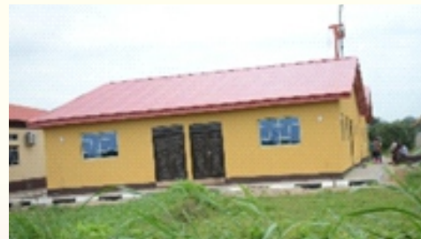
Renovated building, Epe