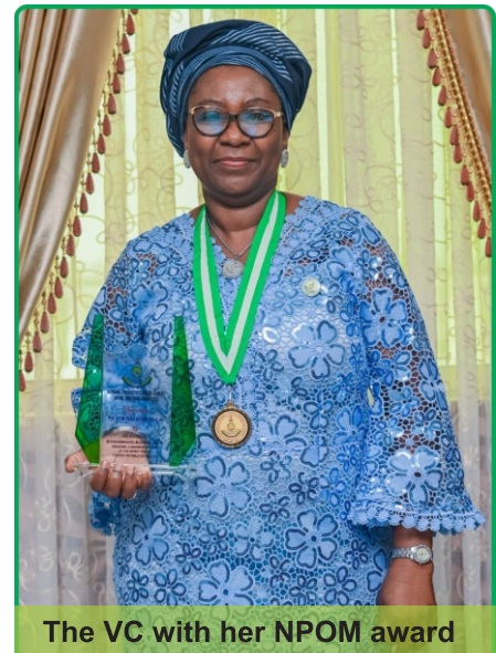
The VC with her NPOM award