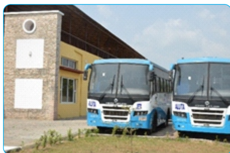
New Students buses