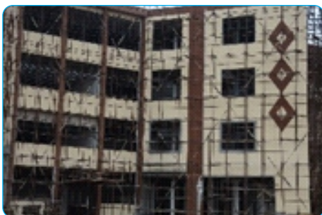
Main Library nearing competition