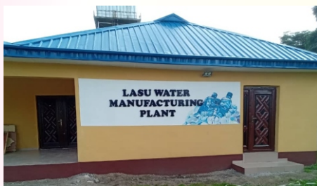
LASU water plant