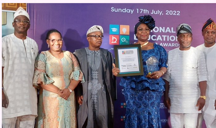
When the VC won the Tertiary Education Administrator of the Year Award