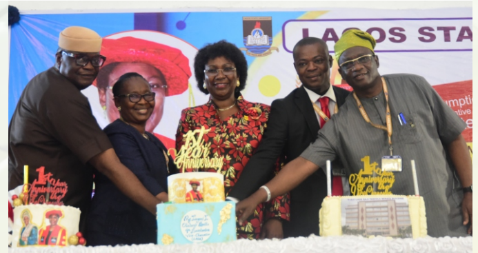
Members of the University Management cutting the first anniversary cake in 2022.