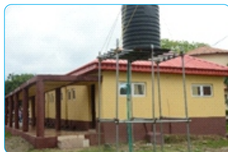
Newly built Toilet facility. main campus, Ojo