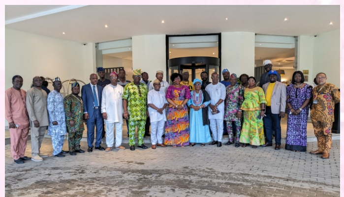
Members of extended Management at a retreat