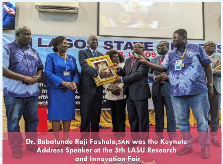
Dr. Babatunde Raji Fashola, SAN was the Keynote Address Speaker at the 5th LASU Research and Innovation Fair