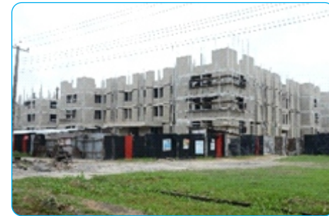
8,000 bed Hostel facility, Ojo main campus