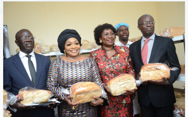
Inauguration of the LASU Bakery on the 1st Anniversary of the administration