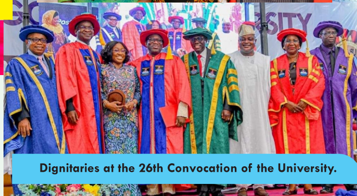
Dignitaries at the 26th Convocation of the University.