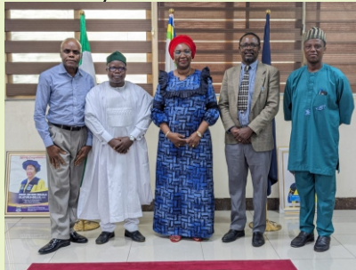
The VC receives two fellows of the Carnegie African Diaspora Fellowship