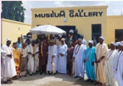
Newly renovated LASU museum, Agege