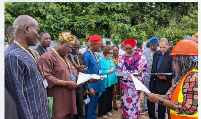
Inspection visit to the Manufacturing Assistant Centre at the Epe Campus.