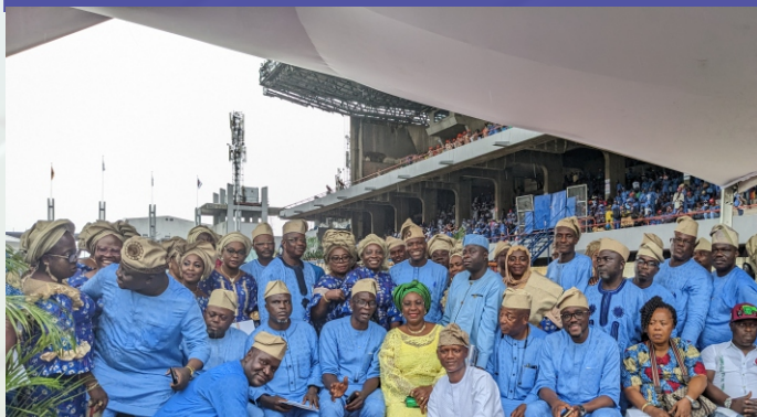
Members of the Momentous of Men and Women in Lagos State Tertiary Institutions for Good Governance (MOWLAS and MOMLAS) at the inauguration of Governor Babajide Sanwo-Olu for a second term.