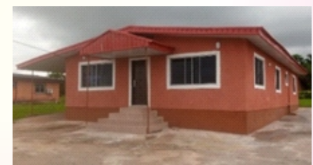
Staff quarters, Epe