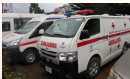
New Ambulance buses