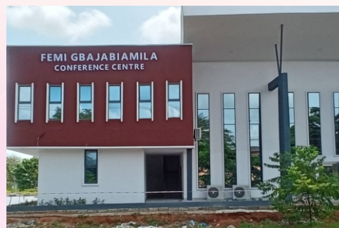
Femi Gbajabiamila conference Centre