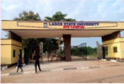
The New LASU gate house, Iraye, Epe