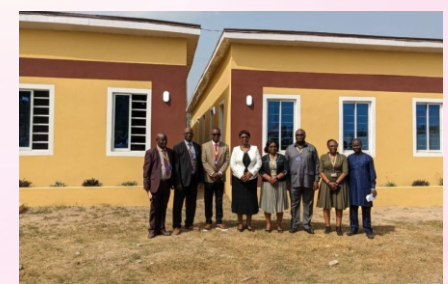
Twin cafeteria building, Badagry campus