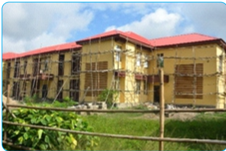
School of Communication Building